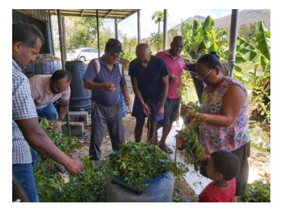
Sorting neem leaves