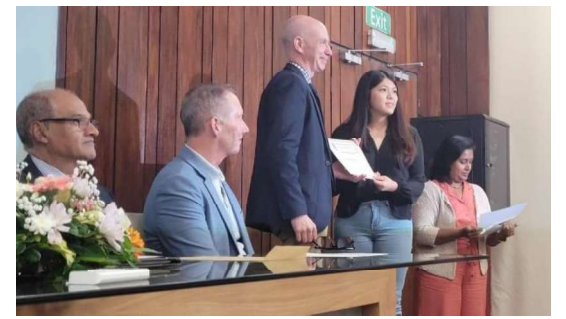
Training on smart agriculture techniques held at University of Mauritius and certificates awarded